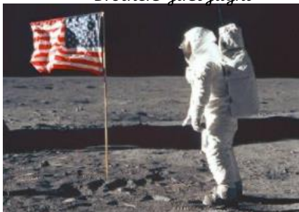
Photographs of Armstrong's moon landing