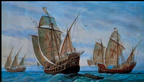
Painting of Columbus' three ships

A list of events in the order they happened.