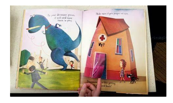
Lift the flap books