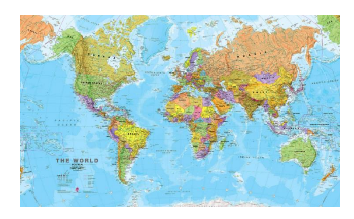
Map A map shows where things are.